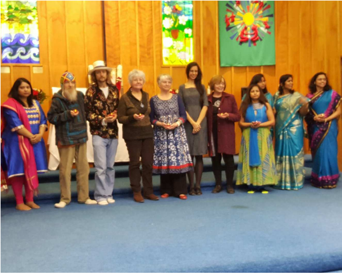
"Representatives of many Faiths, including Latter-day Saints, gathered to discuss "Selfless Service - the Spirit of Oneness" at an event organized by the Sri Sathya Sai Baba Centre on November 20, 2016."