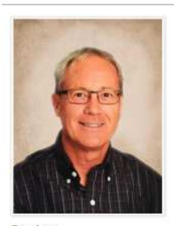
Services FUNERAL SERVICE Saturday March 11, 2017 10:30 AM See Obituary Text